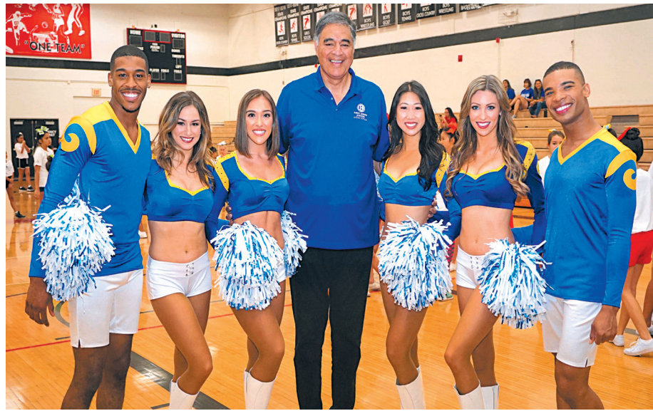
The author (center) poses with LA Rams cheerleaders, who taught and performed at a cheer clinic June 15 at 'Iolani School.

Of all the measures that were introduced, Bill 89 was the legislative vehicle selected by Hawai'i Lodging & Tourism Association from the very beginning of this arduous undertaking to sort out the numerous approaches to dealing with illegal vacation rentals. We said time and time again that the hotel industry welcomed competition, but that we firmly opposed illegal,