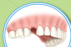
MISSING SINGLE TOOTH

State-of-the-Art CT scanning is an essential diagnostic tool when planning for dental implants. It provides a three dimensional image and cross-sectional images of the jaw to show bone volume and density, supporting a higher standard of dental implant care.