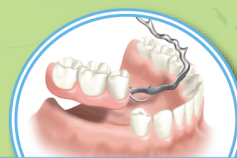
MISSING MULTIPLE TEETH

Dental implants will rid you of your partial denture or flipper. Unlike bridges, they prevent bone loss and preserve adjacent teeth.