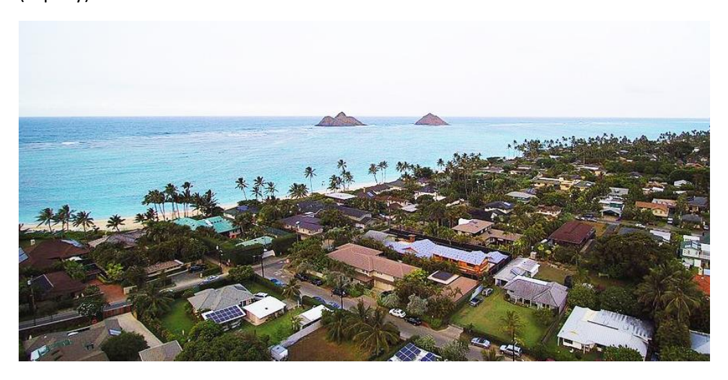
Lanikai Park (East) by Ethan of Chapman

Last year nearly one in three U.S. travelers stayed in home-based accommodation units compared to one in ten in 2011. A search by the New Orleans Planning Commission found more than 40 websites that facilitate short-term rentals ranging from single rooms in private homes to entire villas. The most conspicuous among them is Airbnb, self-described as a people-to-people platform founded in San Francisco in 2008. In 2016, Airbnb listed 3 million homes and hosted 70 million guests; by 2025, analysts predict the company's share of U.S. hotel and short-term rentals will rise to 13% compared to 2.3% in 2016. Other well-known short term rental platforms include HomeAway (VRBO) and TripAdvisor (FlipKey).